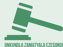
IINKUNDLA ZAMATYALA EZESONDO

Uluvo lweenkundla zamatyala ezesondo lwaphuhliswa eMzantsi Afrika. Ngo-2013, imodeli yenkundla yamatyala ezesondo entsha yaye yaphuhliswa, emisela yonke into efunekayo ukuba inkundla ibe yinkundla yamatyala ezesondo. Le modeli ifuna ukuba ezi nkundla zibe nabatshutshisi* abaqeqeshwe ngokukhethekileyo, abaxhasi benkundla kunye noomantyi**. Inkundla yamatyala ezesondo inegumbi lenkundla elahlukanisiweyo. Kananjalo inegumbi lokunika ubungqina elinezixhobo ze-CCTV, apho abantwana banokunika khona ubungqina ngaphandle kokuba bajongane nomdlwenguli okanye umoni buqu, ngexa bethetha ngento eyenzekileyo.