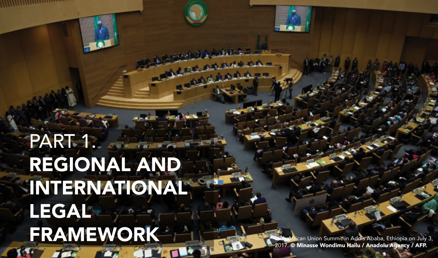
2011 African Union Summit in Addis Ababa, Ethiopia on July 3, 2017.